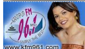
Photo blog PHALANO.com